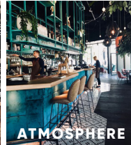
The look, lighting, music...