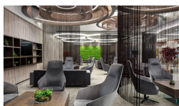
Clarion Hotel Congress Prague, CZ