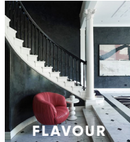
From food to art to uniforms.

Clarion hotels are designed with creativity and attention to detail, to reveal a design story to our guests. Each curated hotel design is developed using our FLAIR design framework , which is integral to the entire Clarion design process, and results in each hotel leaving a lasting impression on our guests.