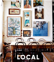
An experience inspired by the destination.