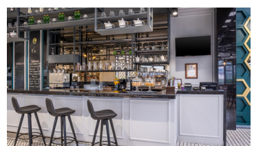
Clarion Hotel Golden Horn, TU

LET'S GET DOWN TO BUSINESS. Choice Hotels EMEA is a hotel performance enabling partner, exclusively for franchisees, offering them the opportunity to customise our services for their individual needs. To find out more visit joinchoicehotels.com