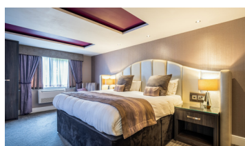
Clarion Hotel Newcastle South, UK