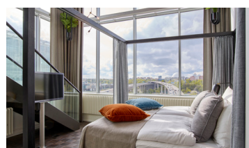
Clarion Hotel Stockholm, SE