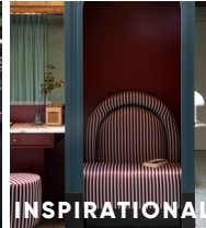
Original, surprising, value-added elements.